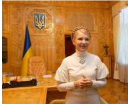
▲ The first day in the new job. Yulia Tymoshenko, Ukraine's new prime minister, in her office.

Ukraine can bank on Germany's active support in implementing needed reforms.